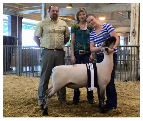
Reserve Champion ram at the 2015 Illinois Shropshire Spectacular Sale