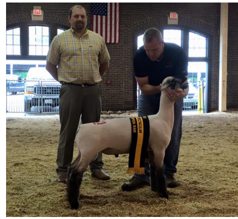
Champion Ram at the 2015 Illinois Shropshire Spectacular Sale