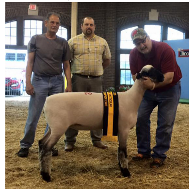
Champion Ewe at the 2015 Illinois Shropshire Spectacular Sale

A young yearling ewe with a lot of growth potential left. Flashy style & good breed character. Check her out to complete your show flock.