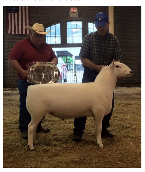
Champion Ram was consigned by Misty Acres at the 2015 National Cheviot Sale