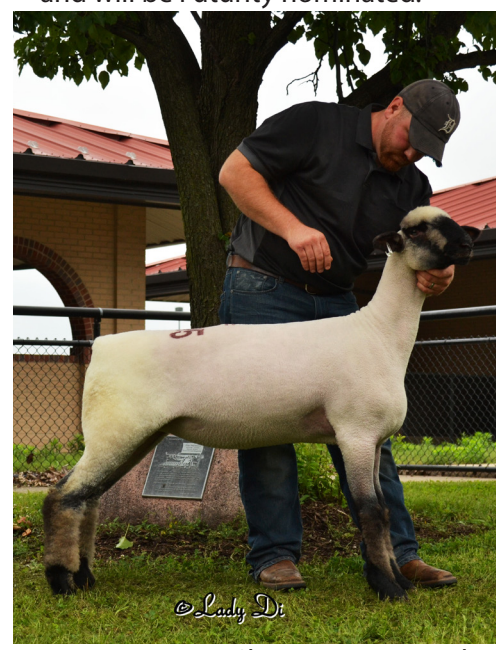
Reserve Junior Champion ewe at the 2015 National Oxford Sale

Born: 9-26-15 TW Sire: EVFO 316 QRNNP 297999 Dam: EVFO 278 QRNNP 296490 Fancy, Fancy, Fancy! Out of one of our favorite "Sumo" daughters and will be Futurity nominated.