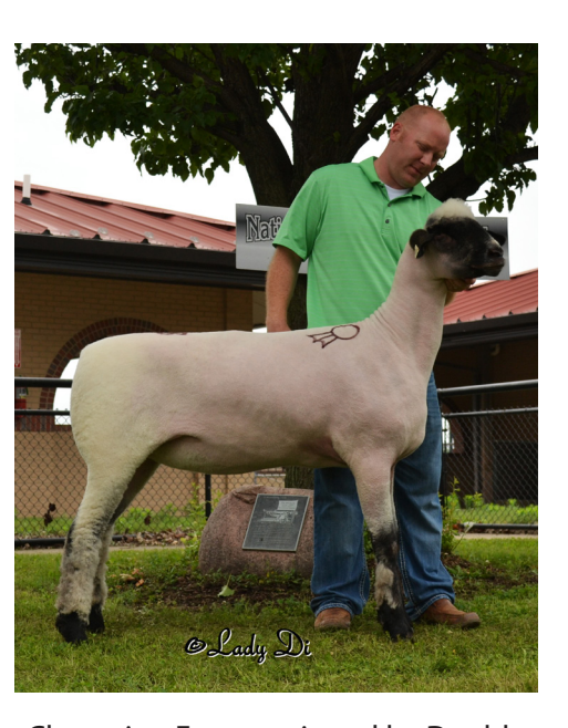
Champion Ewe consigned by Double O Acres at the 2015 National Oxford Show & Sale