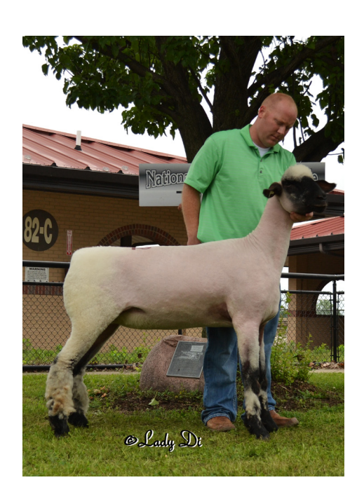
Reserve Senior Champion ewe at the 2015 National Oxford Sale

Dam: Wallpe 0007 "Taft" 299032 I've saved the best for last. 0031 is one of our later ewes born but man is she the ewe that stands out. Big bodied, massive rack, thick twist all tucked into a neatly assembled shoulder & hip. No doubt you need to show this one as a slick and let her muscle do the talking. Watch her walk away, her skeleton is right, all landing on that sasquatch bone.