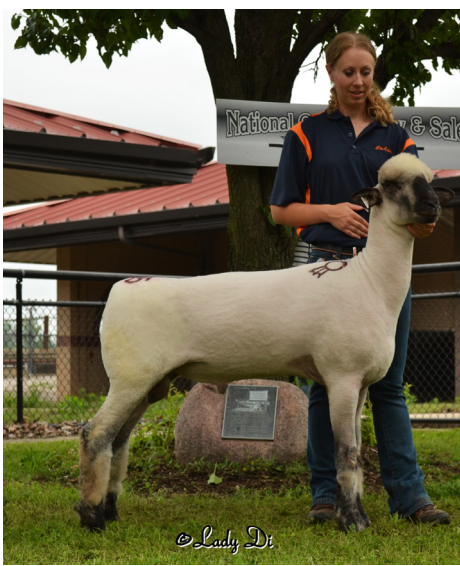
Reserve Champion ram consigned by Winning Ways at the 2015 National Oxford Sale